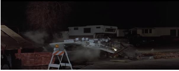
Poor decisions lead to a crash.