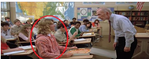
Future Hospital Administrator