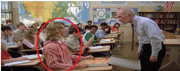
This is Jeff Spicoli. He is a high school student with no clear idea of the purpose of school, no goals (other than next high), and no skills (other than surfing).