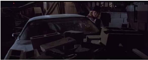
Surveying the damage.