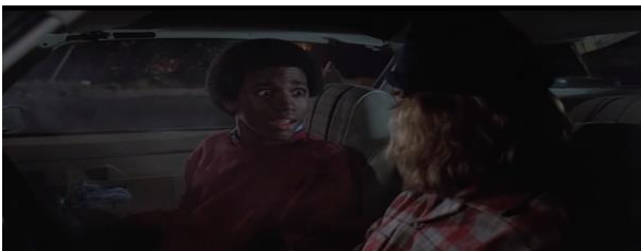
Immediate feedback on the consequences. "My brother is going to kill us!"