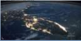
NSA Earth Observatory (Public Domain)