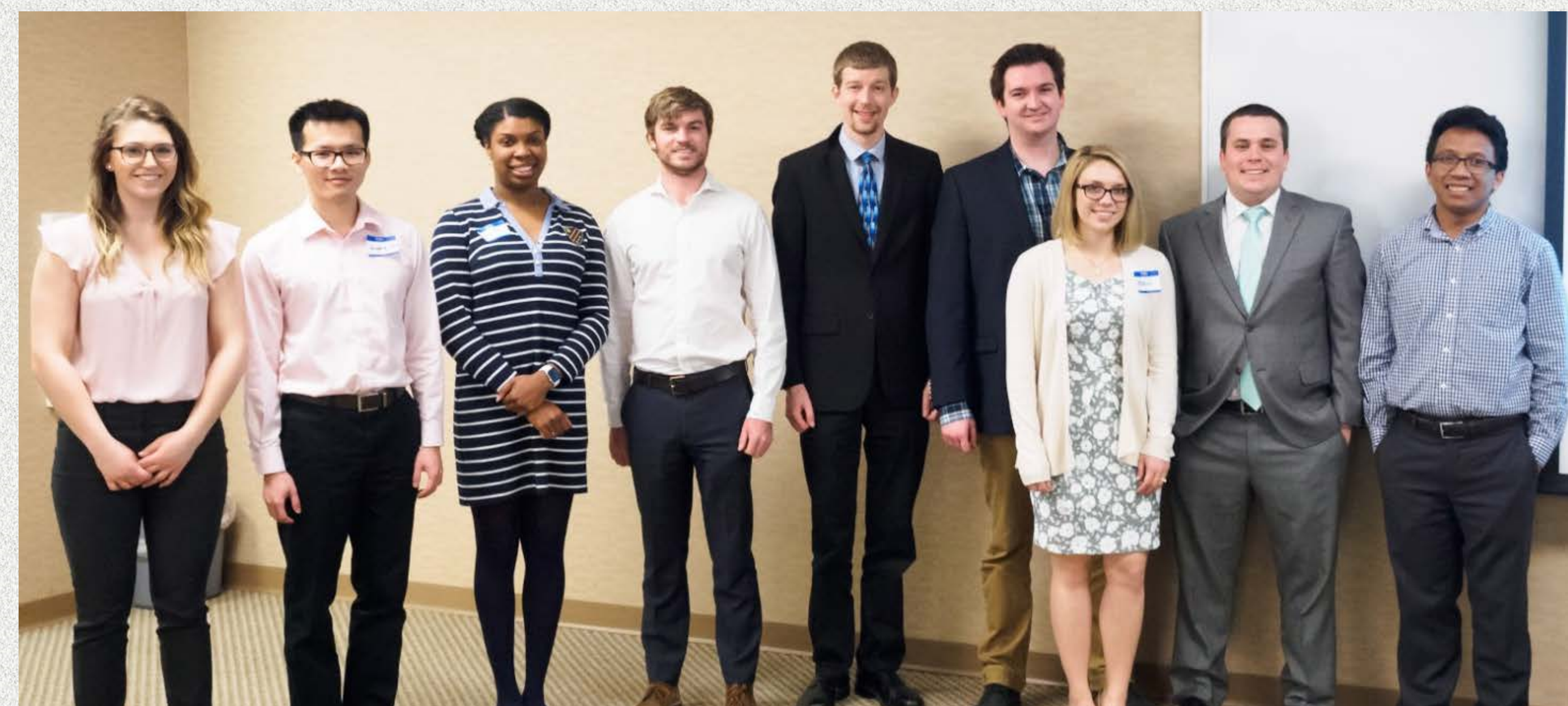
(Above) 2018 GLC YIS participants