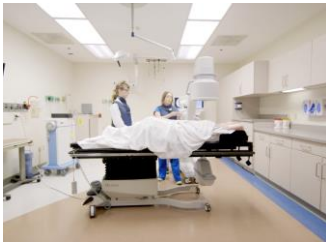
https://radonc.wustl.edu/education/campep-accredited-medical-physics-residency/ (not an actual patient)

For most fractions, brachy RTTs use a C-arm in the HDR suite to film these patients prior to treatment