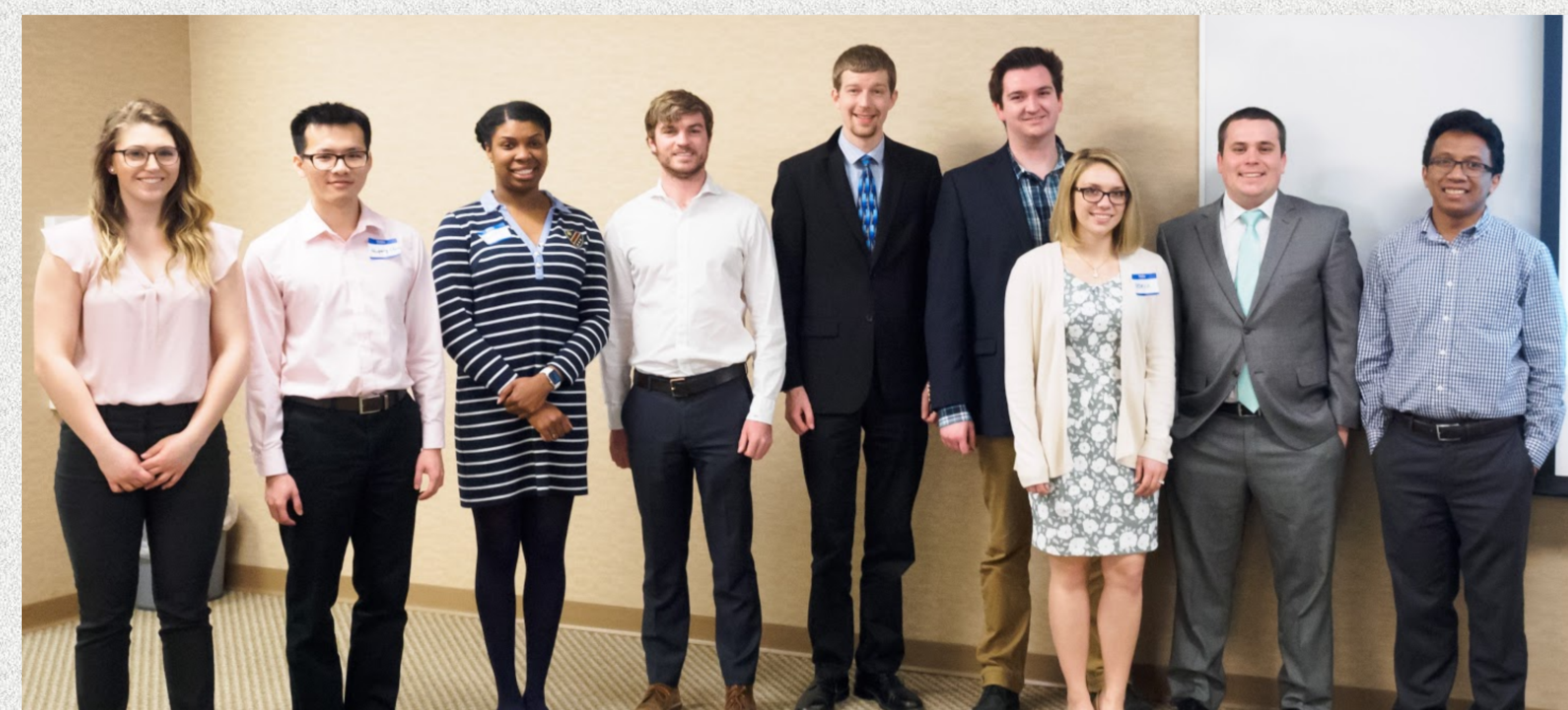
(Above) 2018 GLC YIS participants