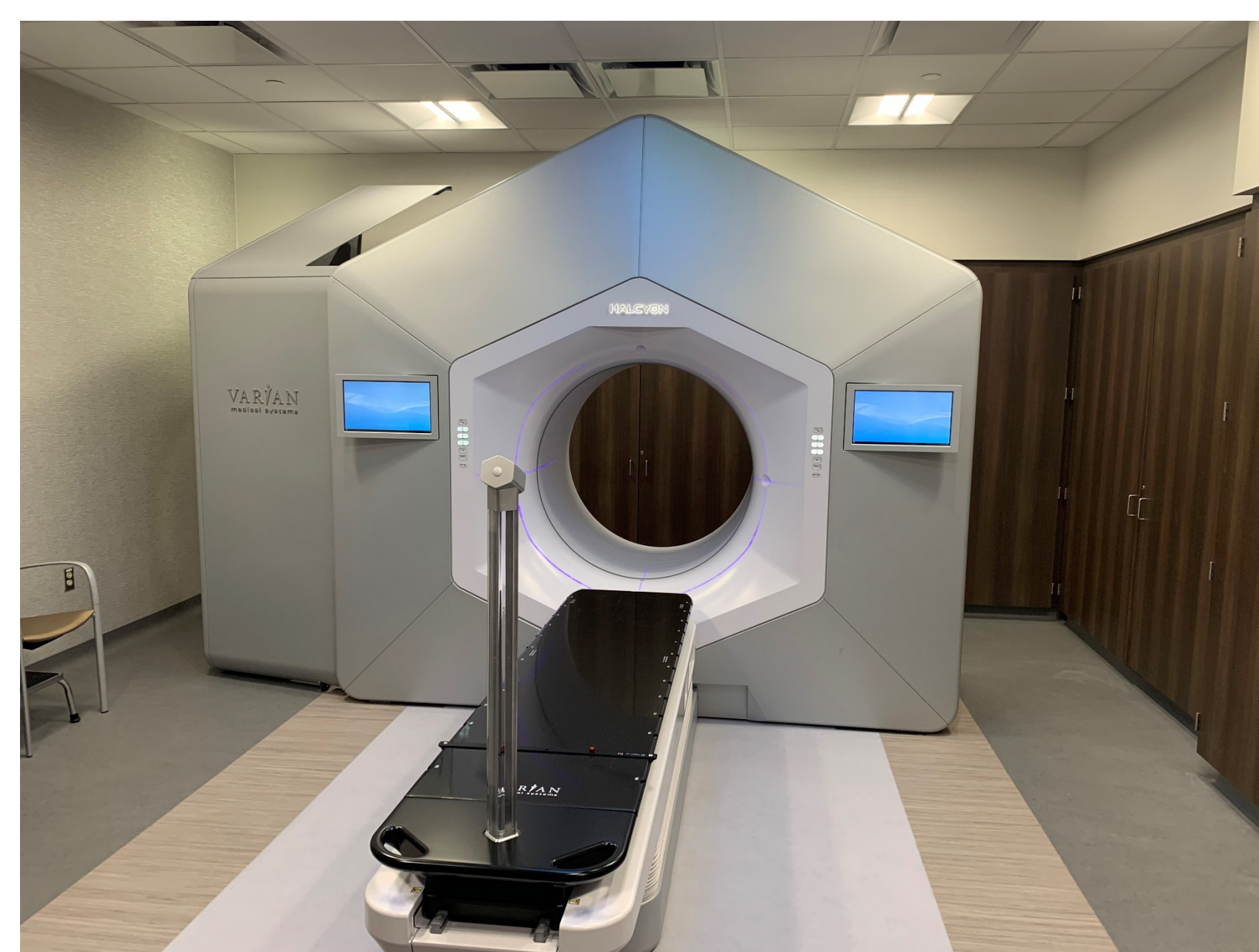
Halcyon machine of Saint Barnabas Medical Center