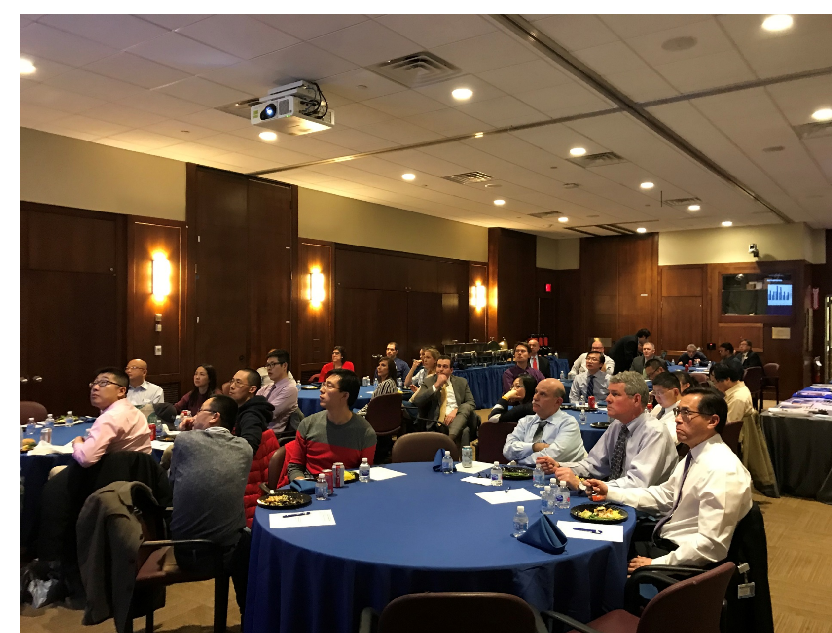
Attendances of Spring 2019 chapter meeting