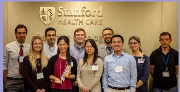
The examiners are faculty members from Bay Area

February 2 nd : ABR Therapy Physics Mock Exam, Stanford Cancer Center