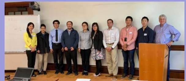
All YI Symposium Winners

May 31 st : Young Investigator's Symposium, UC Berkeley